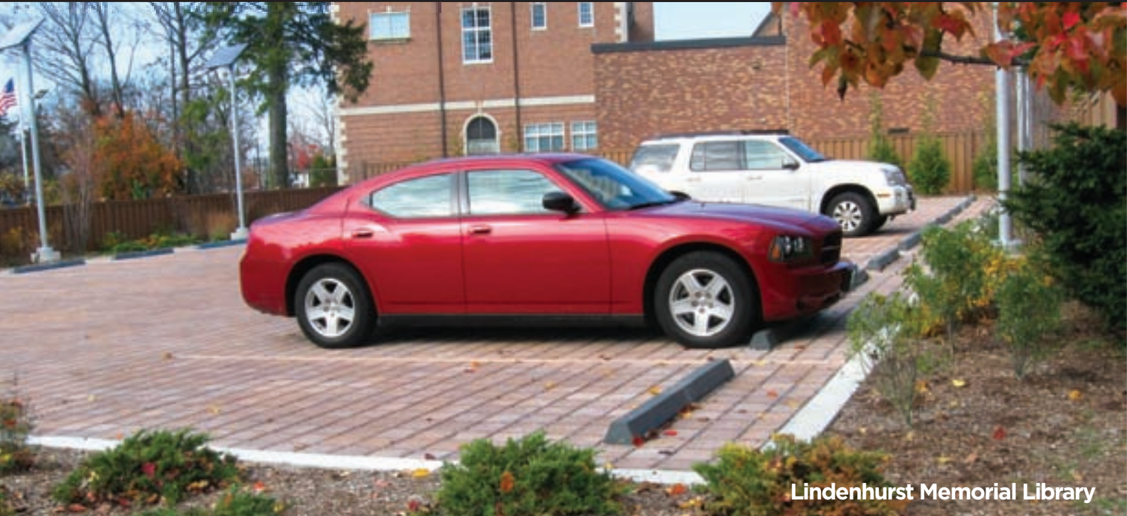
Lindenhurst Memorial Library