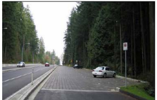
SF-Rima™ parking lot